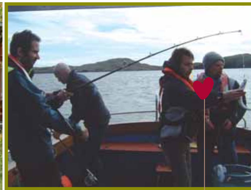
Shetland Community Drugs team