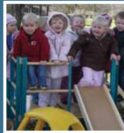
Edzell Pre-school Playgroup

“Lloyds TSB Foundation for Scotland funds charities registered in Scotland whose work is focused on improving quality of life and creating equality of opportunity for people in Scotland. This applies particularly to those who are disadvantaged or marginalised.”