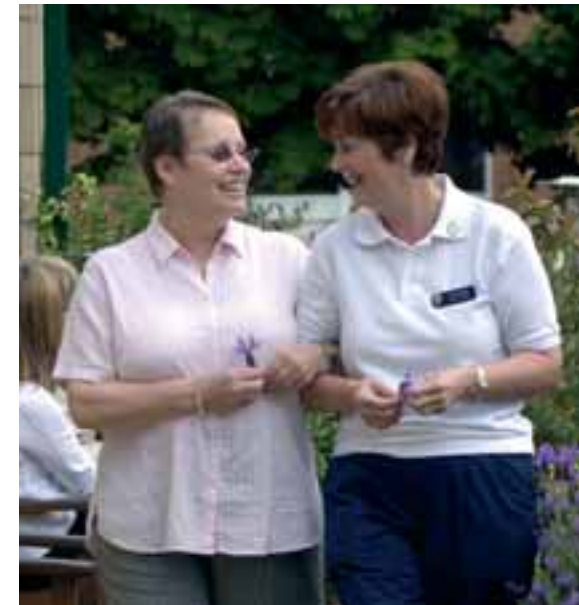
The Prince and Princess of Wales Hospice

There is one round of overseas awards each year. In 2008 the deadline for submissions was 14th April and decisions on who will receive funding will be made in August.