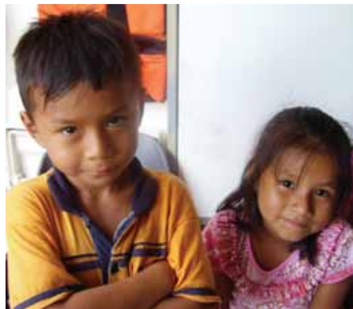
Children in Peru supported by The Vine Trust

"Our award of £7,408 will allow us to build four new classrooms, meaning that each class in the two schools we support will have a permanent room."