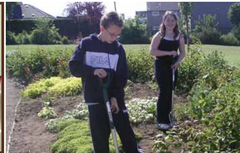
Loanhead Community Learning Centre