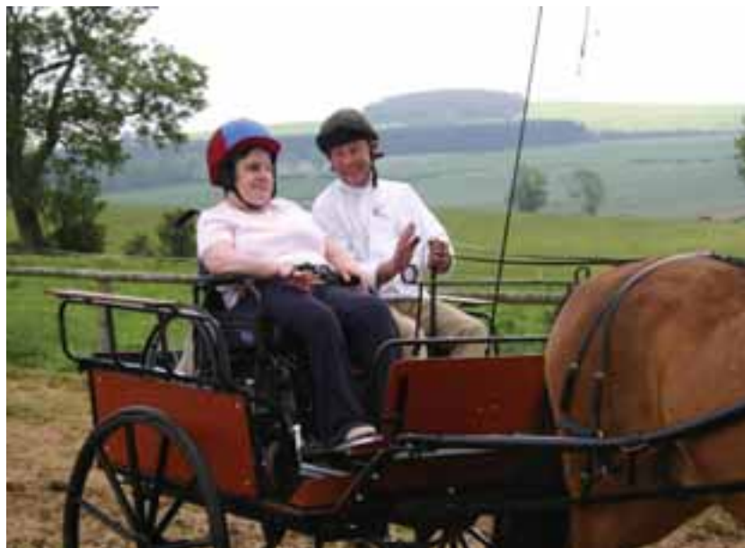
Interest Link Borders