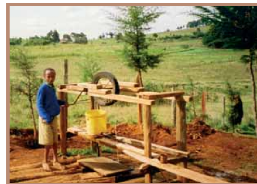
A pupil drawing water from a spring at a school in Kenya supported by the Ribban Children's Trust