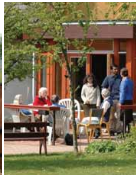
Simeon Care for the Elderly