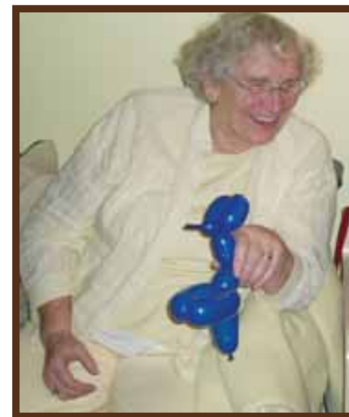
Stirling Carers Centre