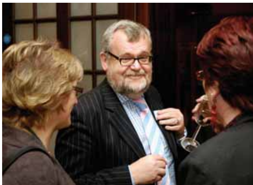
The Foundation's Annual Dinner