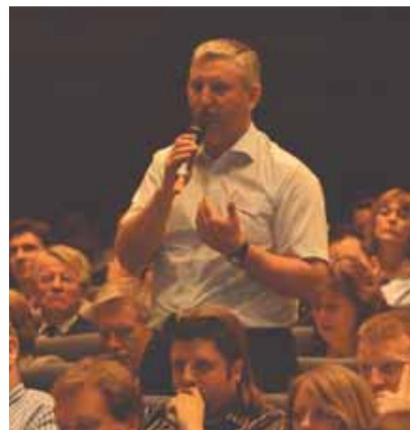
The Foundation's Annual Forum