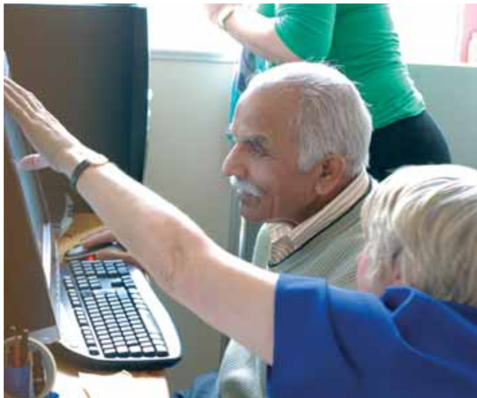
Living Memory Association

More detail on what we will or won't fund is in our criteria, priorities and principles leaflets. These are on our website, www.ltsbfoundationforscotland.org.uk , or you can call us on 0870 902 1201 and we'll send you copies.