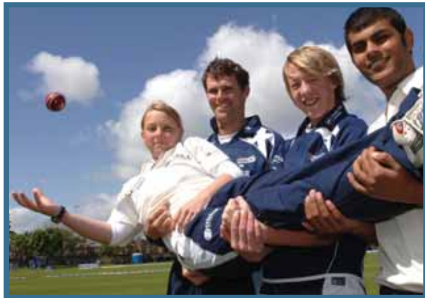
Lloyds TSB Scotland's cricket sponsorship