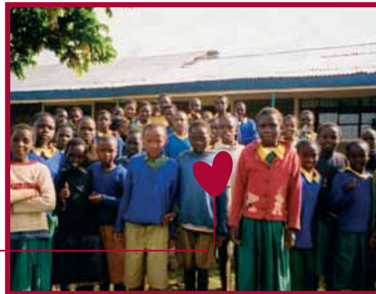
Children in front of their new classroom built by the Ribban Children's Trust

Our overseas awards are open to registered Scottish charities managing work in fragile overseas communities.