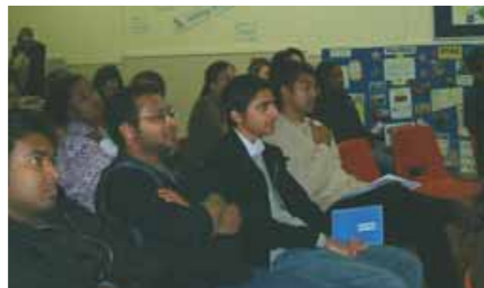
Aberdeen International Centre