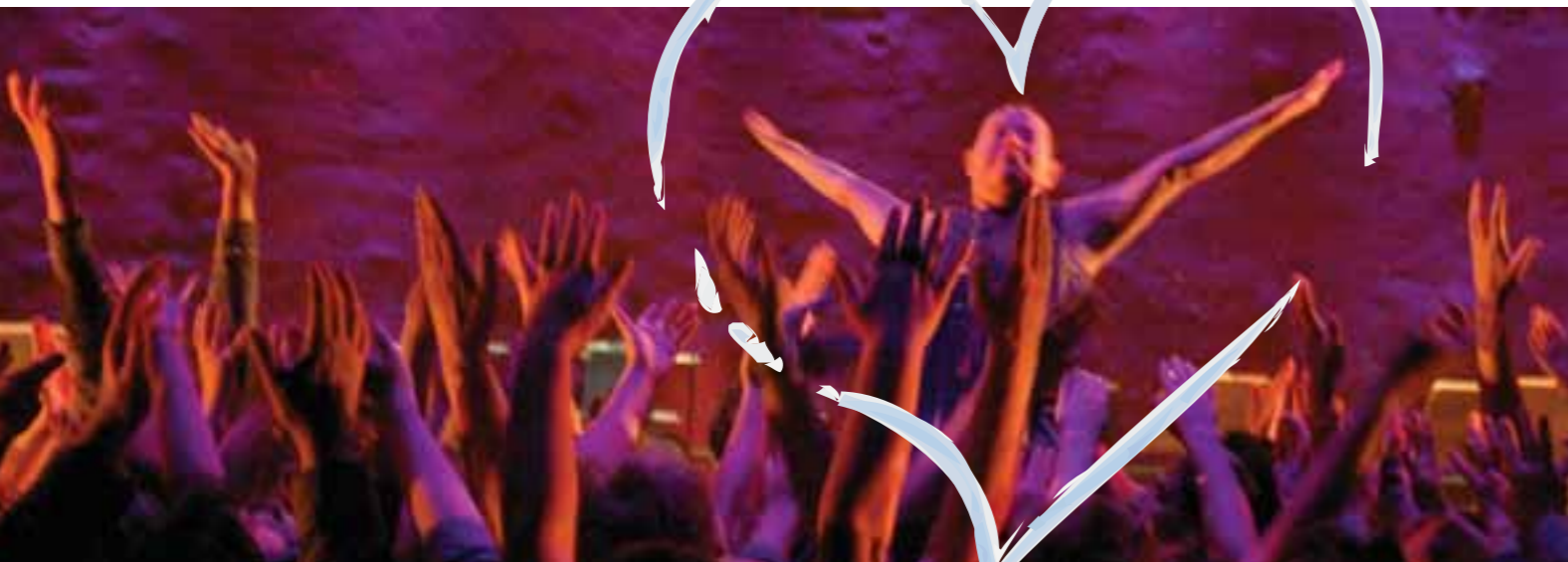
An Indepen-dance performance

As well as providing funding for people and projects, we're also interested in helping charities themselves develop. Our organisational review awards give your organisation dedicated time with a consultant who can help you understand what is working and any changes you may want to consider about the way you operate.