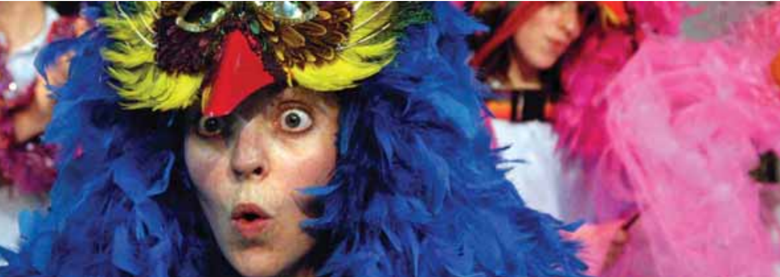
A Giant Productions Limited performance

All staff employed by Lloyds TSB Scotland plc, Cheltenham & Gloucester, Scottish Widows, Black Horse and other Lloyds TSB Group Subsidiaries can apply for up to £400 a year to match their work for charities. This may be for either fundraising activities or voluntary time.