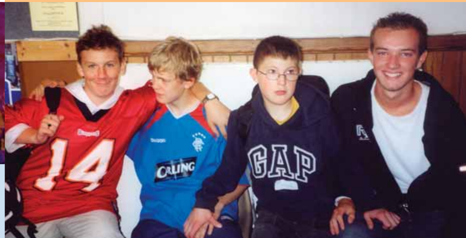
Young people involved with East Lothian Special Needs Playschemes