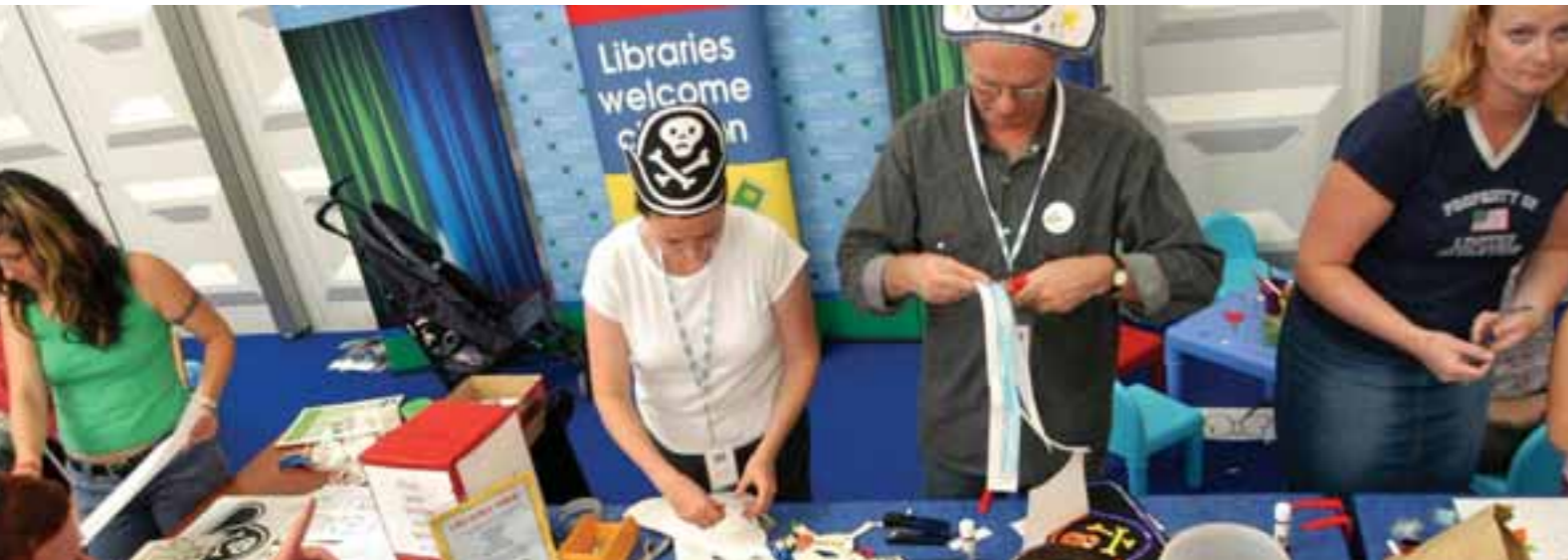
Supporting the Children's Programme at the Edinburgh International Book Festival

Through the Foundation and in many other ways, Lloyds TSB Scotland demonstrates its commitment to society. It does so out of the belief that it's wise to support the economic well-being and social development of the communities from which it draws its people and its business.