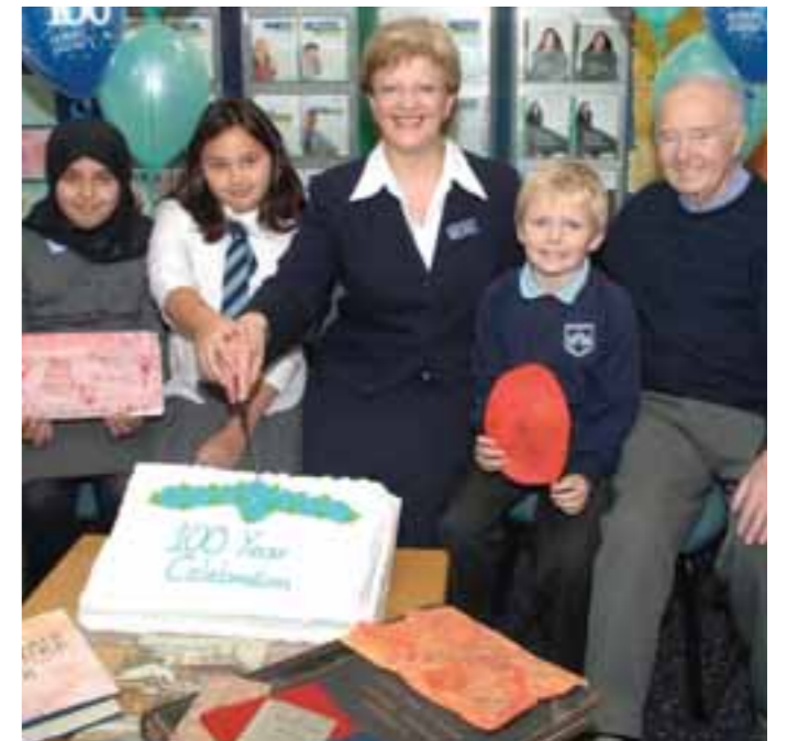
Celebrating 100 years in Hamilton with local customers and children

"As one of Scotland's largest employers, Lloyds TSB Scotland has an important role to play in strengthening the economic and social base of the country. By adopting socially responsible practices, and actively engaging with all facets of society, we create economic benefit for ourselves, our people and the communities where we do business."