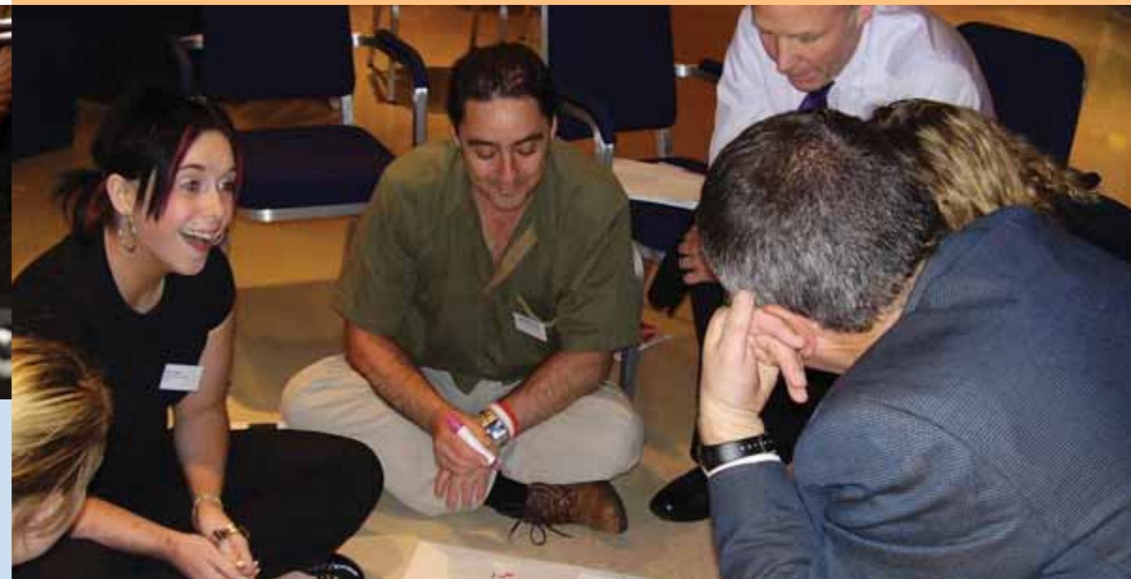
West Lothian Youth Action run a workshop at the Partnership Drugs Initiative conference

Over 77% of the money went to fund running costs, and almost 16% to fund salaries, with the remaining 6.5% funding capital projects.