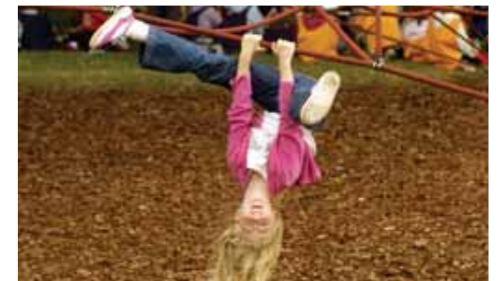
Family Service Unit Scotland

"The research work being carried out with this money is likely to have a very real impact on the quality of lives of our ageing population."