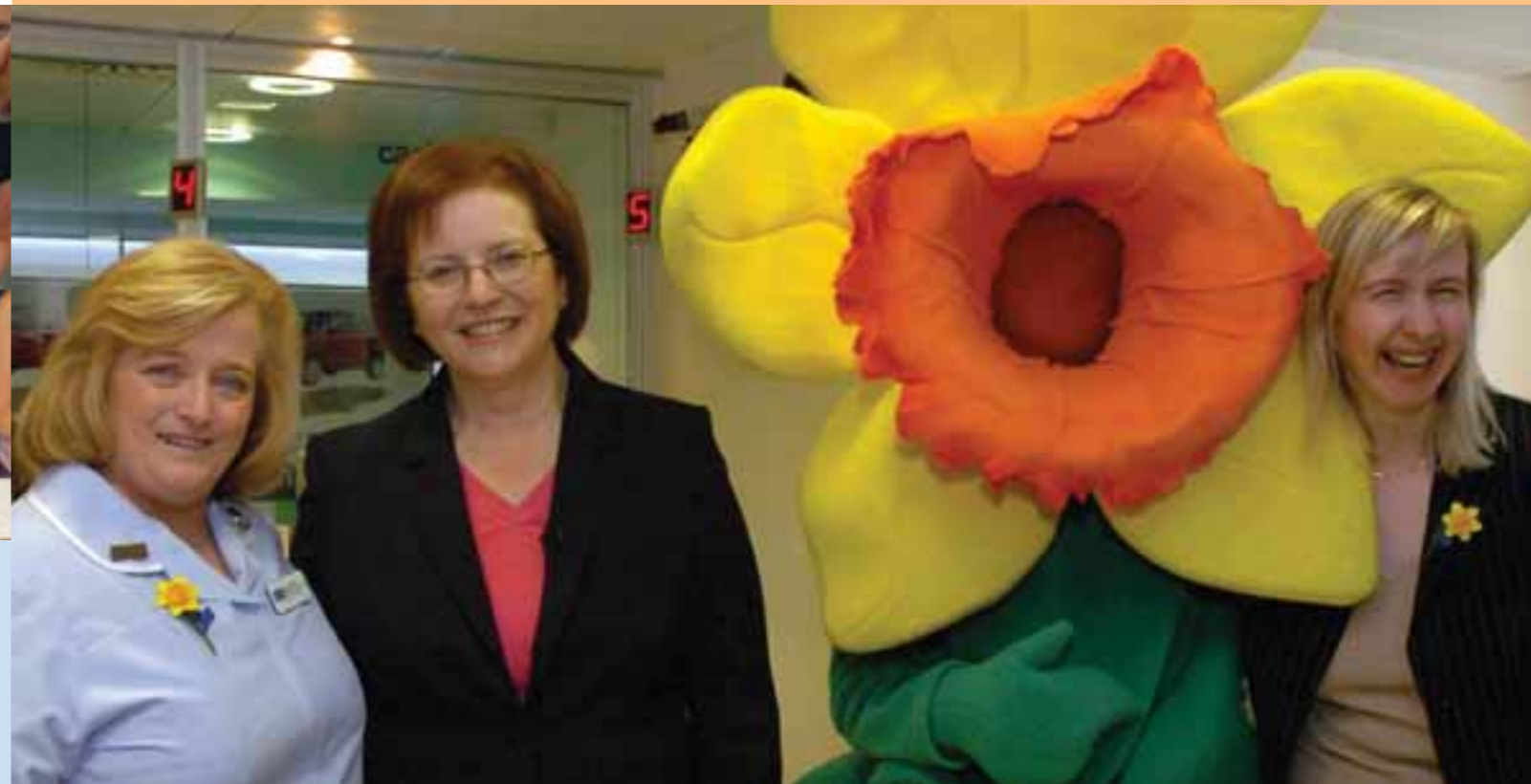
Susan Rice and staff from Marie Curie Cancer Care

Those who work for Lloyds TSB Scotland and other parts of the Lloyds TSB Group in Scotland such as Scottish Widows and Black Horse Finance share this commitment to supporting their local communities by giving both their time and their money to a whole variety of other organisations, and much of their fundraising activity is match-funded by the Foundation.