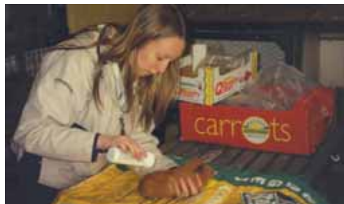
Work at Gorgie City Farm