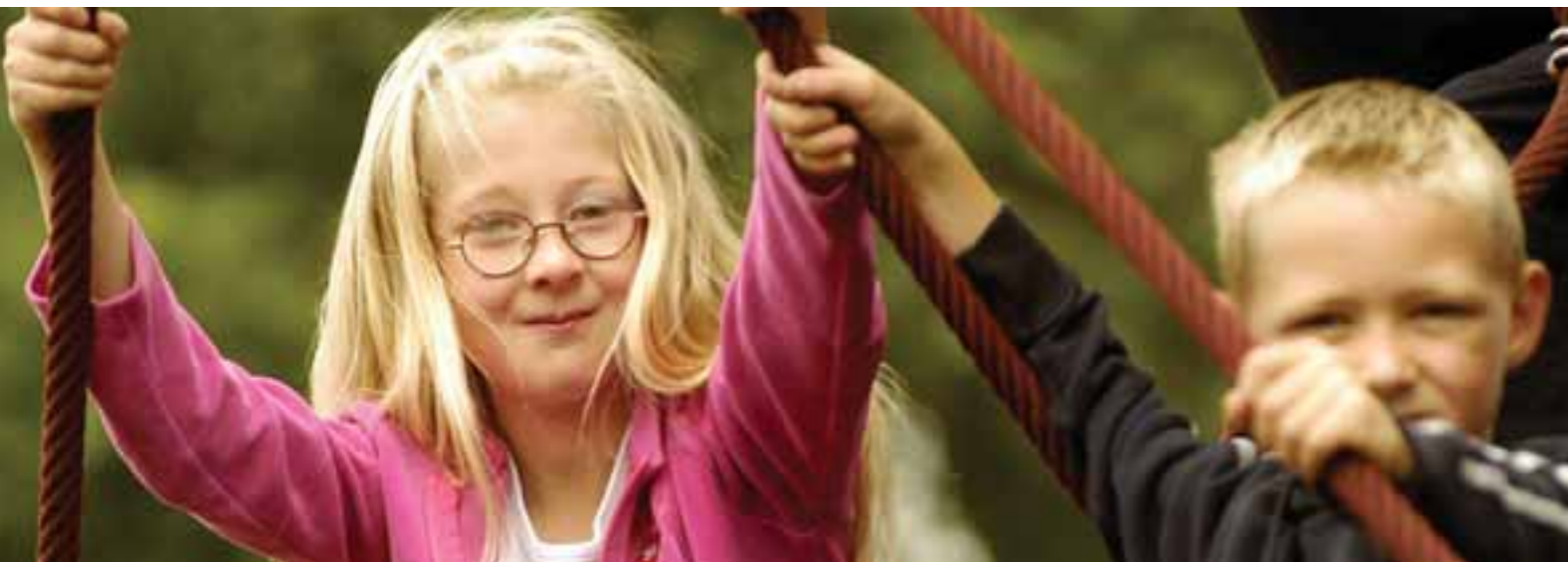
Family Service Unit Scotland

The Partnership Drugs Initiative (PDI) promotes voluntary sector work with vulnerable children and young people affected by substance misuse. It has been running since 2000 and is funded by the Foundation, the Scottish Executive and Atlantic Philanthropies.