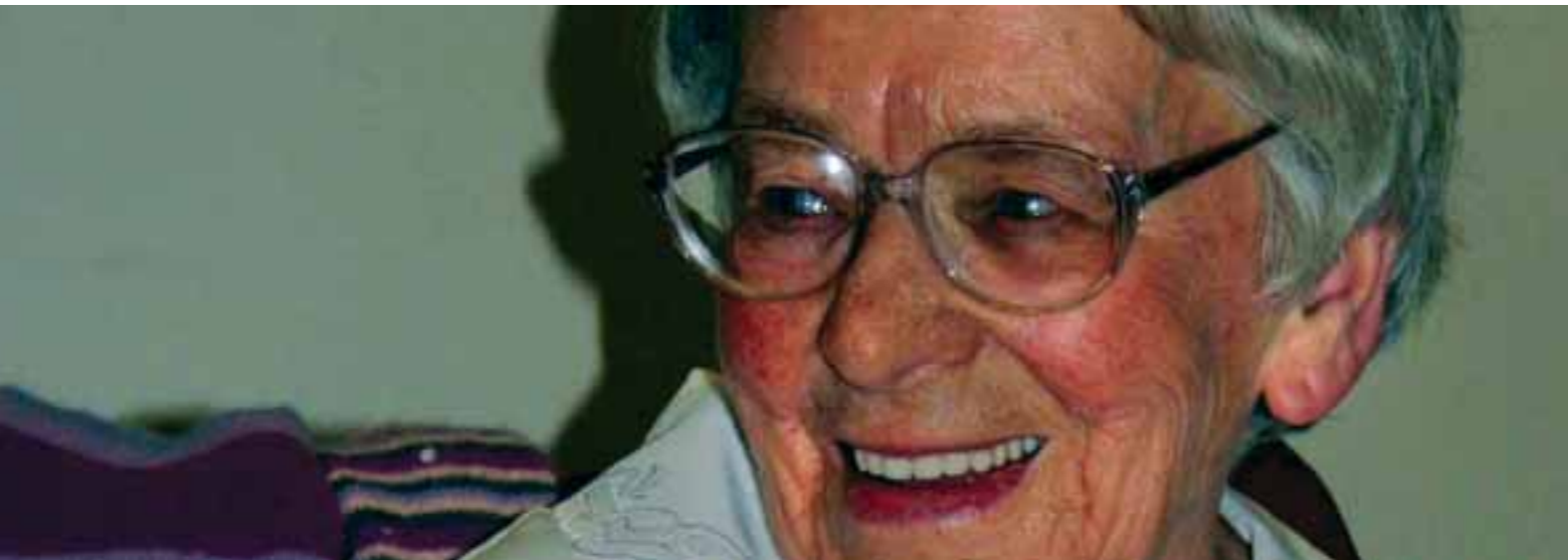
Voluntary Action's BefriendER project in East Renfrewshire

The Foundation distributes its funds to recognised charities in Scotland which are focused on improving quality of life and creating equality of opportunity for people in Scotland. This applies particularly to those who are disadvantaged or marginalised. In 2005 we reviewed the criteria used by our Trustees, consulting with over 500 Scottish charities.