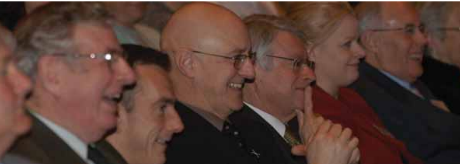
2005 Annual Forum

We want to deliver a service which makes it easier for voluntary sector organisations to get help and advice on our grantmaking.